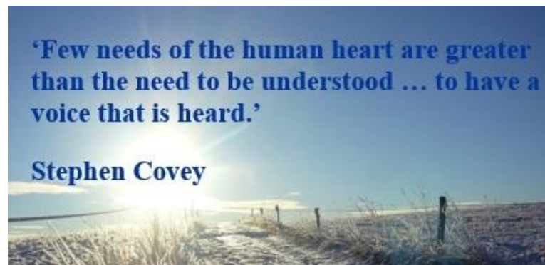
Image 2: Stephen Covey, author of 'Seven Habits of Highly Effective People' on consultation